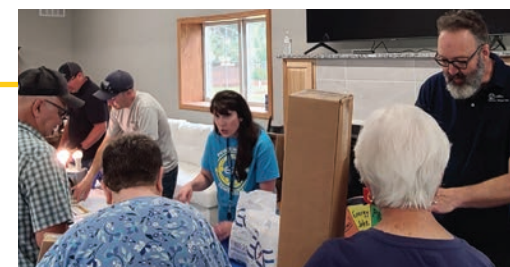
An energy efficiency "blitz" in Cambridge.