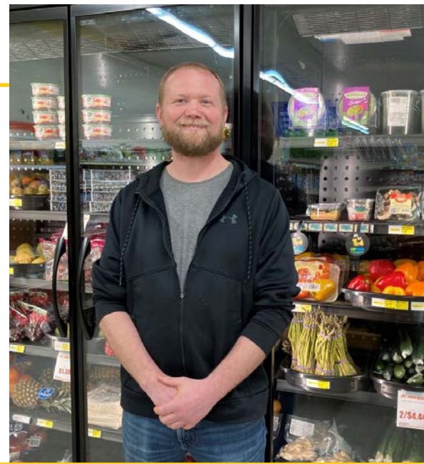
Owner of Aaron's Grocery in Fertile with new, energy efficient coolers.