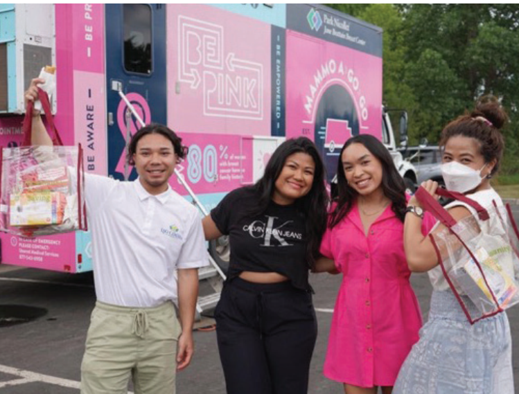
CEED distributing energy education packets at a community gathering in Brooklyn Center.