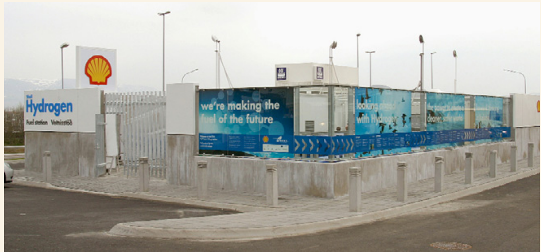
Completed hydrogen fueling station in Iceland