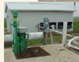
Digester pump (foreground) and gas house, which stores the engines