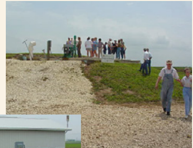
Farm tour of the Top Deck Holstein Dairy Farm's Microturbine