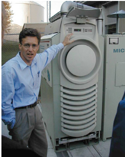
Microturbine installation at a Minnegasco Facility

page 75 – Toyota.com (upper), National Renewable Energy Laboratory (lower left), Schatz Energy Research Center (lower right); page 76– http://www.athygli.is/myndir.html ; page 77 – National Renewable Energy Laboratory ; page 78 – Alliant Energy ; 79 – Jon Heer/CenterPoint Energy