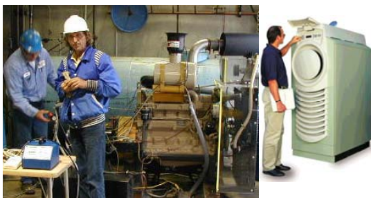
Figure 1 – 100 hp Diesel engine in operation firing wood gas at EERC, and an example of a 30 kW microturbine shown to right.

Demonstrate a portable power plant in use at a commercial enterprise converting biomass residue to electric power.