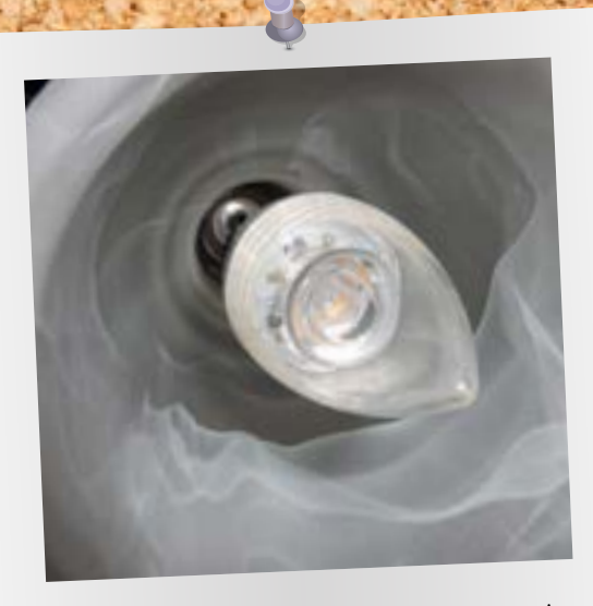
To do: Swap in LED light bulbs