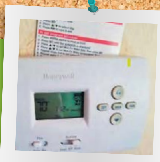
To do: Program the thermostat