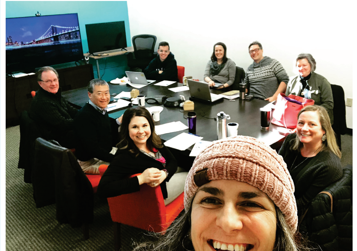
Metro CERT Annual Event