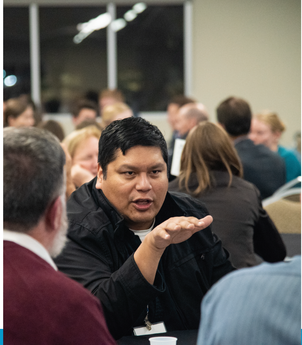
Metro CERT Annual Event