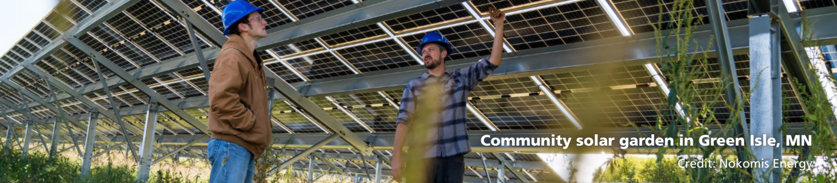
Community solar garden in Green Isle, MN