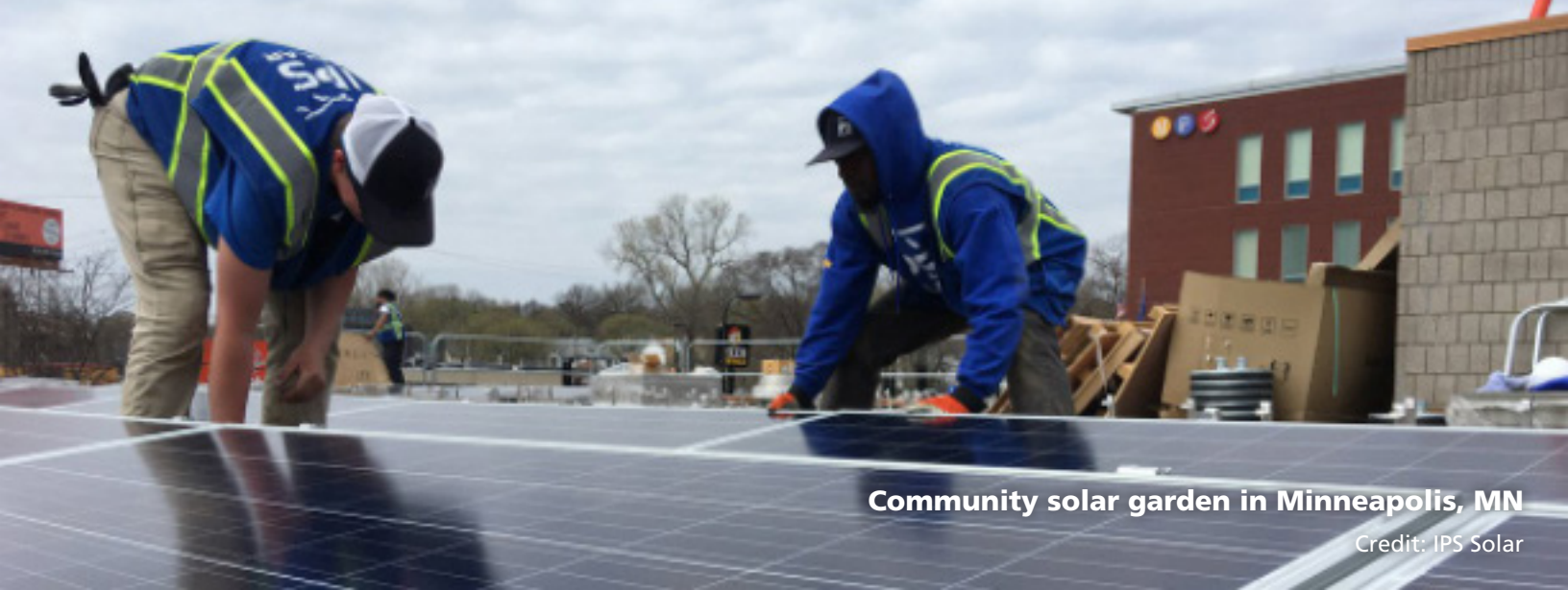
Community solar garden in Minneapolis, MN