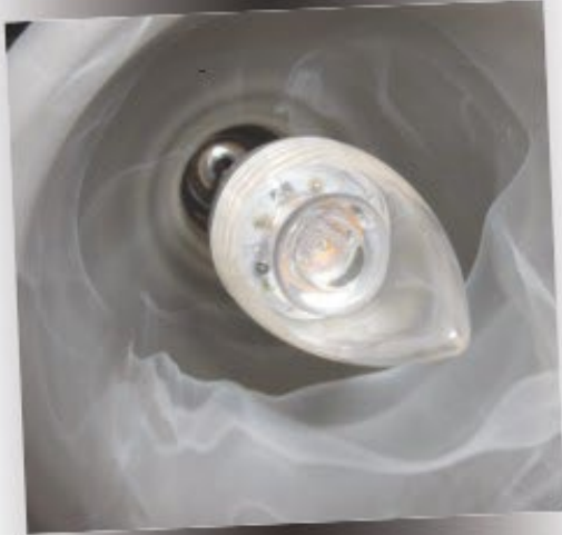
To do: Swap in LED light bulbs