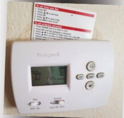
Yuav ua li ca rau thermostat