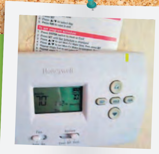
To do: Program the thermostat