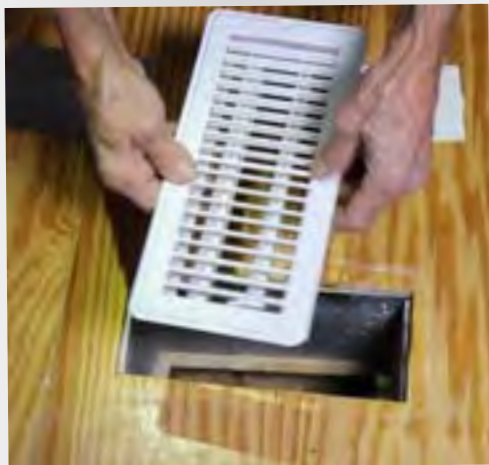
To do: Seal leaky air ducts