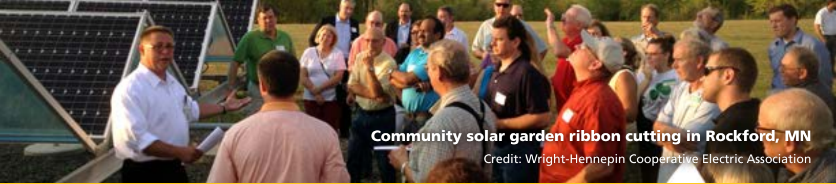
Community solar garden ribbon cutting in Rockford, MN