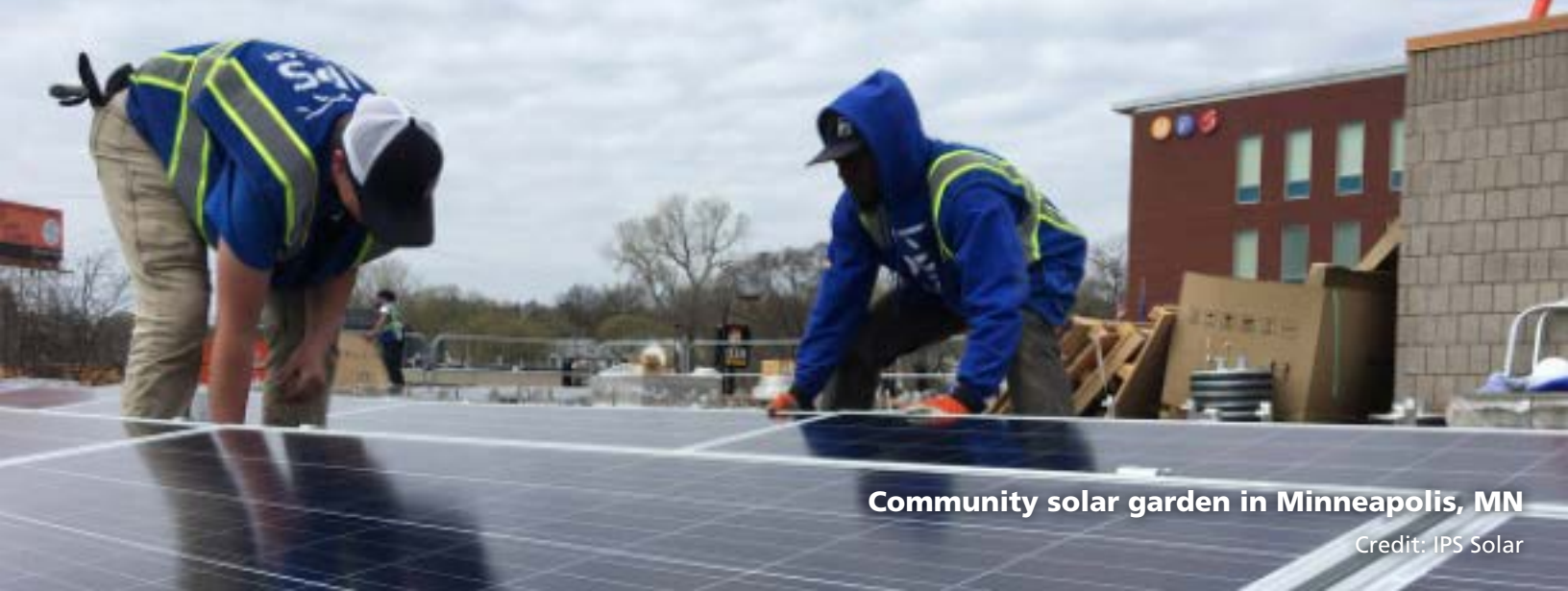
Community solar garden in Minneapolis, MN