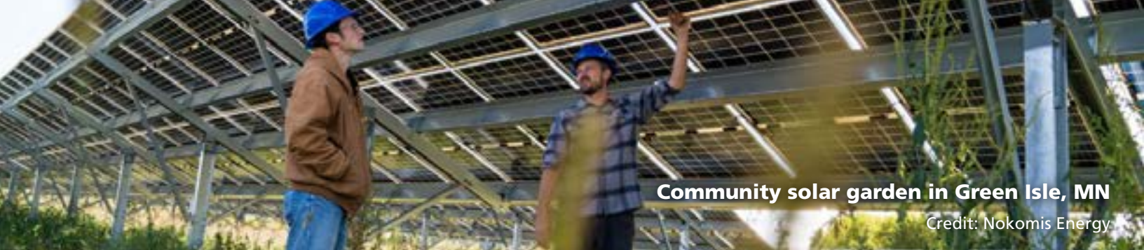
Community solar garden in Green Isle, MN