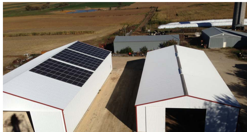
Dennis Hamm Farms Solar Panel Purchase & Installation