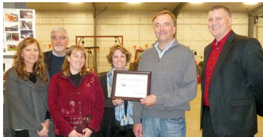
Marzolf Implement (repair shop) Energy efficiency improvements